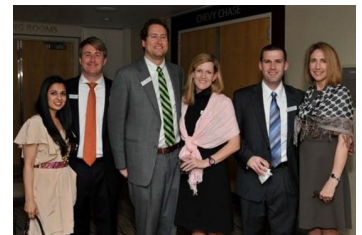
AAPD Lobby Days